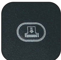
Turbo jam release button clears jams quickly & easily