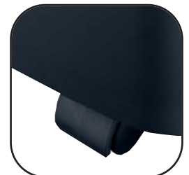
Castors increase mobility