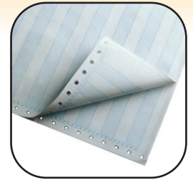
Wide throat permits the shredding of A3 size & continuous computer paper