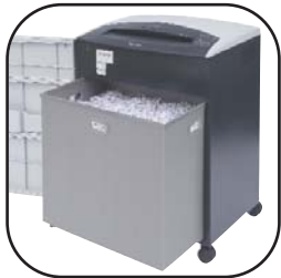
Easy to empty cabinet style bin with pull out waste basket