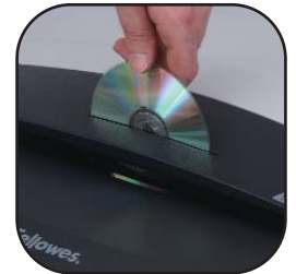
Safely shreds CD's