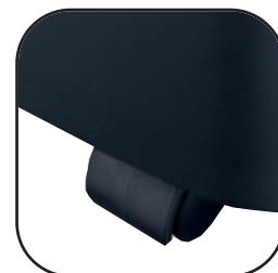
Castors increase mobility