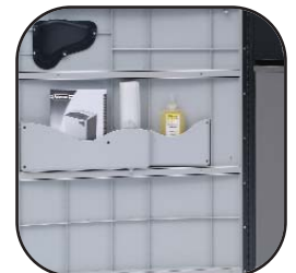
Internal storage area for shredder bags and oil