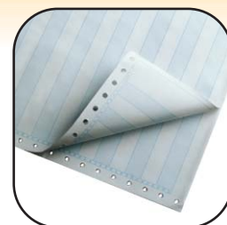
Wide throat permits the shredding of A3 size & continuous computer paper