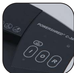
User-friendly control panel