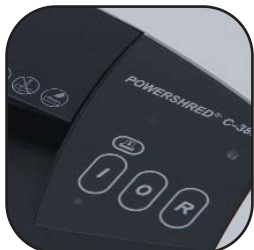
User-friendly control panel