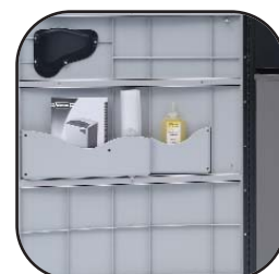
Internal storage area for shredder bags and oil