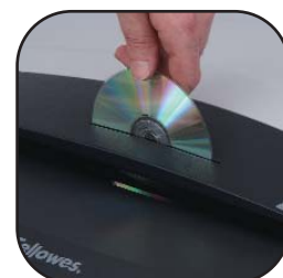
Safely shreds CD's