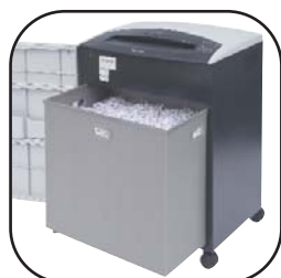
Easy to empty cabinet style bin with pull out waste basket