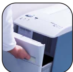
Easy to empty pull out waste bin