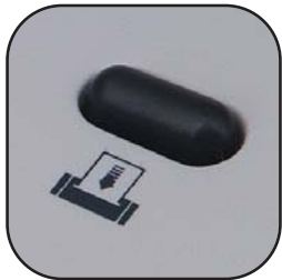
Turbo jam release button clears jams quickly & easily