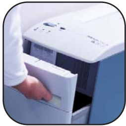
Easy to empty pull out waste bin